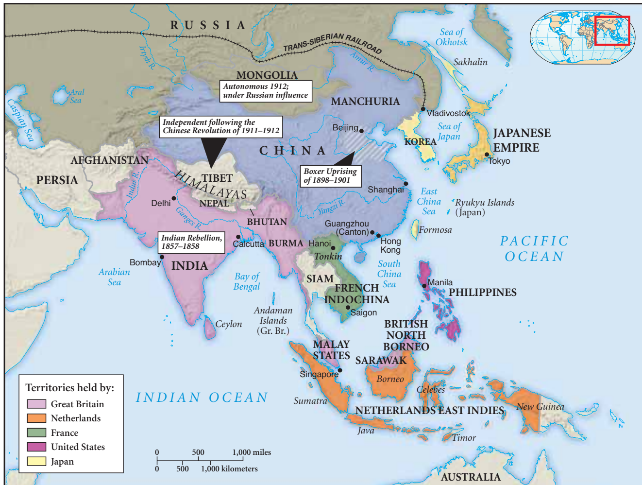
Map 18.1 Colonial Asia in the Early Twentieth Century By the early 1900s, several of the great population centers of Asia had come under the colonial control of Britain, the Netherlands, France, the United States, or Japan.

sixteen years (1882–1898) to finally conquer the recently created West African empire led by Samori Toure. Among the most difficult to subdue were those decentralized societies without any formal state structure. In such cases, Europeans confronted no central authority with which they could negotiate or that they might decisively defeat. It was a matter of village-by-village conquest against extended resistance. As late as 1925, one British official commented on the process as it operated in central Nigeria: “I shall of course go on walloping them until they surrender. It’s a rather piteous sight watching a village being knocked to pieces and I wish there was some other way, but unfortunately there isn’t.” 6 Another very difficult situation for the British lay in South Africa, where they were initially defeated by a Zulu army in 1879 at the Battle of Isandlwana. And twenty years later in what became known as the Boer War (1899–1902), the Boers, white descendants of the earlier Dutch settlers in South Africa, fought bitterly for three years before succumbing to British forces. Perhaps the great disparity in military forces made the final outcome of European victory inevitable, but the conquest of Africa was intensely contested.