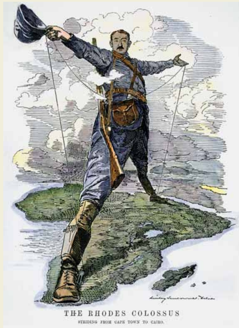
Visual Source 18.3 From the Cape to Cairo