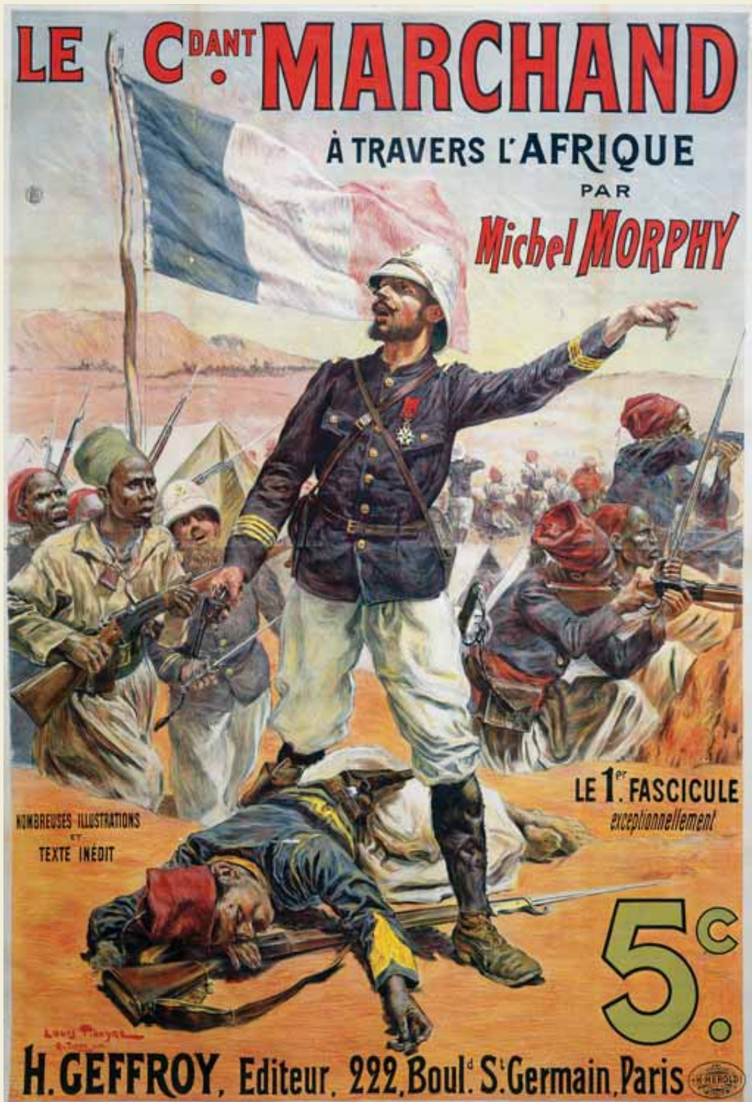
Visual Source 18.2 Conquest and Competition