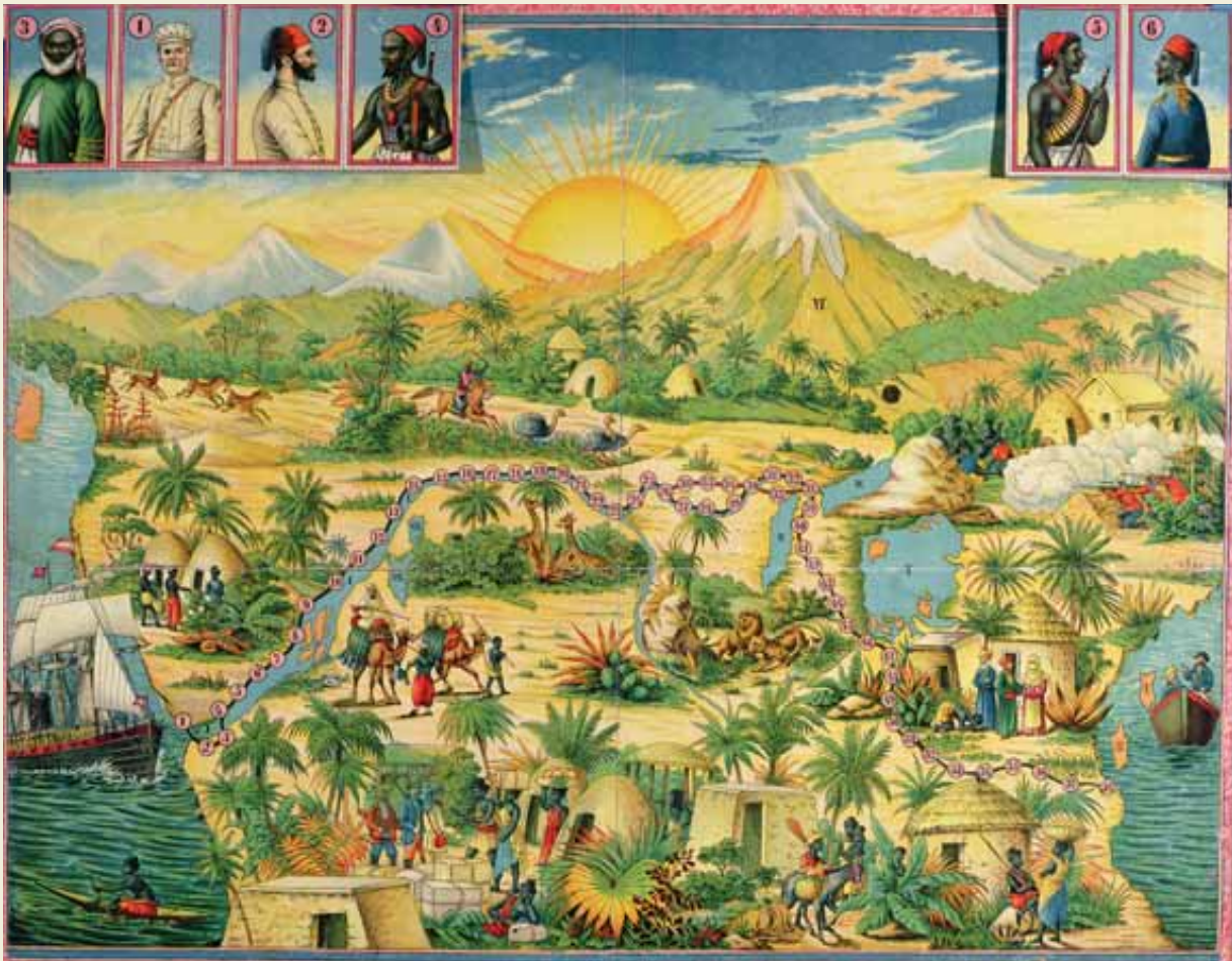
Visual Source 18.1 Prelude to the Scramble

ropeans. Stanley (1841–1904), a British journalist and explorer, gained lasting fame by finding Livingstone, long out of touch with his homeland, deep in the African interior.