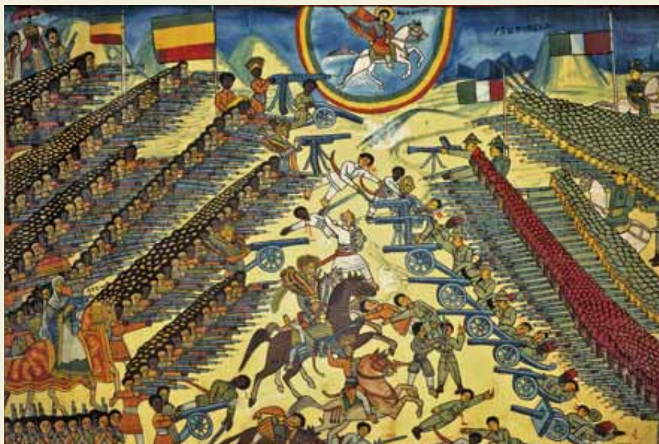
Visual Source 18.5 The Ethiopian Exception

In Visual Source 18.5, an unknown Ethiopian artist, working during the 1940s, celebrated the victory at Adowa at a time when Ethiopia had just fought off yet another Italian effort at conquest, this time led by Mussolini during World War II. The painting itself replicated in both style and content many earlier artistic celebrations of the victory at Adowa. In the upper left corner, Emperor Menelik is shown wearing a crown and seated under a royal umbrella. His queen, Empress Taytu, is visible in the lower left on horseback and holding a revolver. The commander of the Ethiopian forces sits on a brown horse, while leading his troops. At the top of the painting, St. George, the patron saint of Ethiopia, presides over the battle scene within a halo of red, yellow, and green, the colors of the Ethiopian flag adopted shortly after the battle. 37