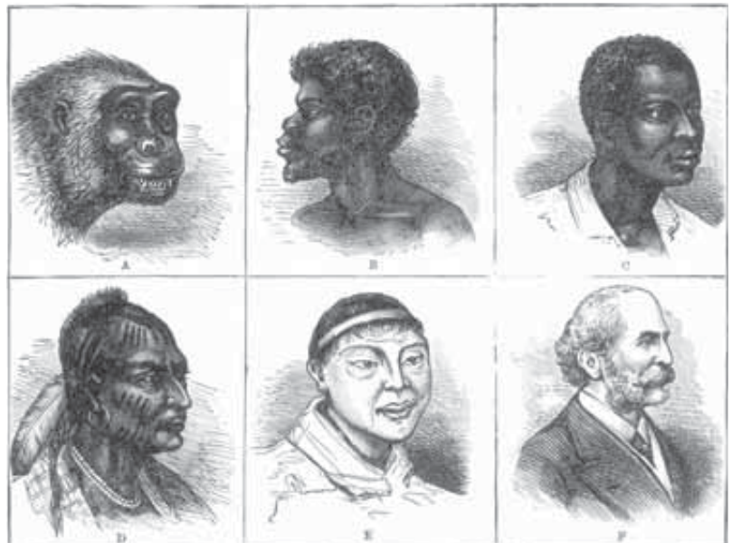
PROGRESSIVE DEVELOPMENT OF MAN.—(a) Evolution illustrated with the six characteristic living forms.

This nineteenth-century chart, depicting the “Progressive Development of Man” from apes to modern Europeans, reflected the racial categories that were so prominent at the time. It also highlights the influence of Darwin’s evolutionary ideas as they were applied to varieties of human beings.