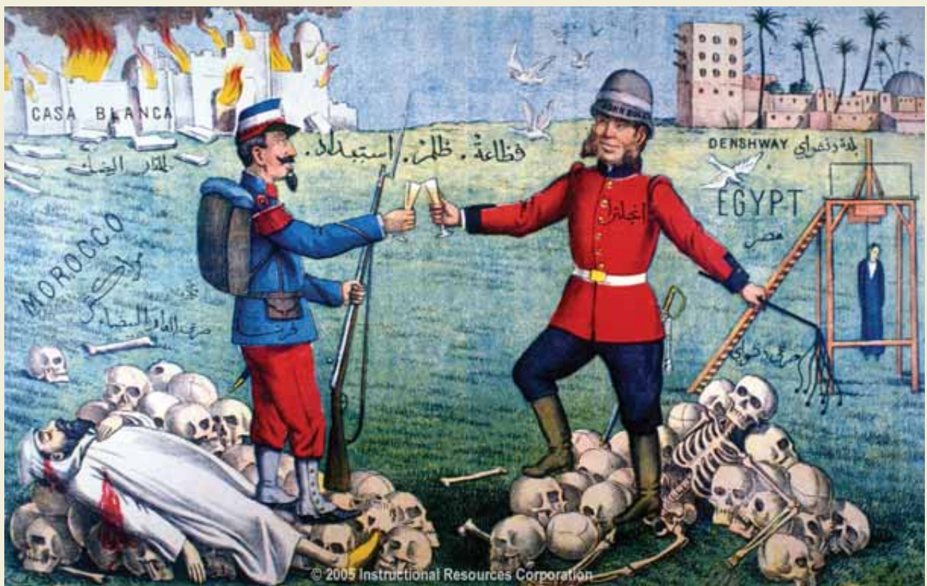
Visual Source 18.4 British and French in North Africa (History Pictures/Instructional Resources Corporation)